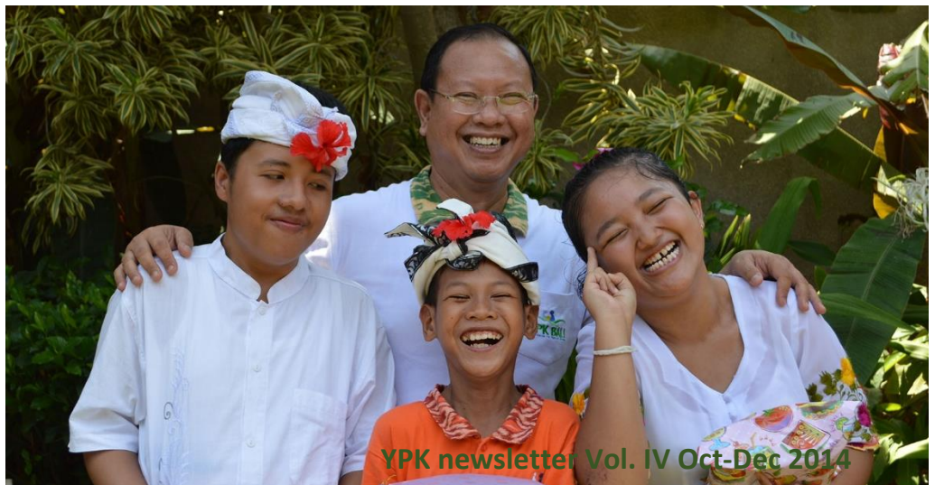
YPK newsletter Vol. IV Oct-Dec 2014