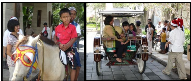
YPK children riding a horse and sitting in a horse-drawn carriage at the Conrad Hilton, Nusa Dua.

All children joined in a wonderful day of eating, drinking, watching performers and playing games with each other. They were also given the opportunity to ride horses and sit in the back of a horse-drawn carriage. Needless to say, it was a fun-filled day for all!