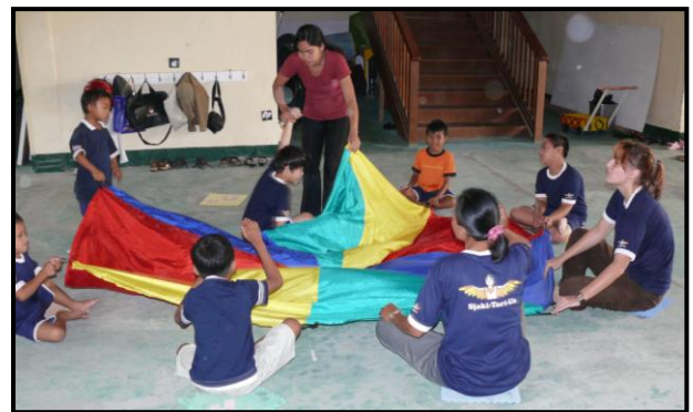
Children at Sjaki-Tari-U playing a game with a parachute.